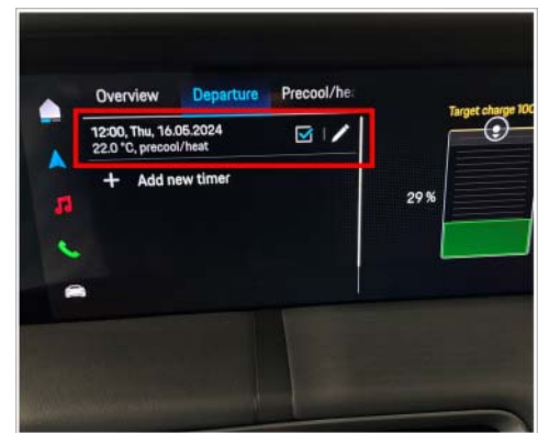
Charge timer example