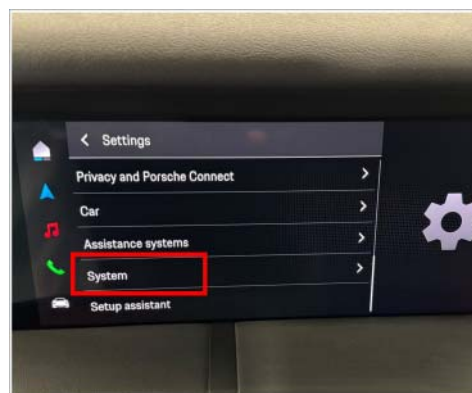
Settings - System

2.2 Select "System" => Settings - System .