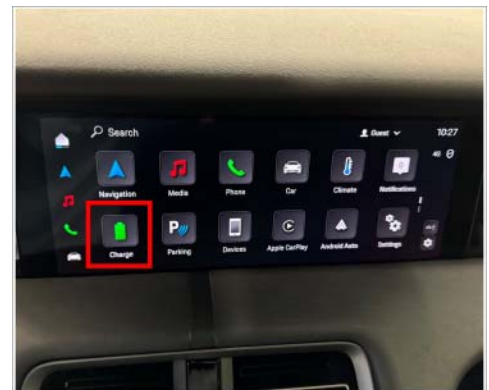
Main menu - Charging