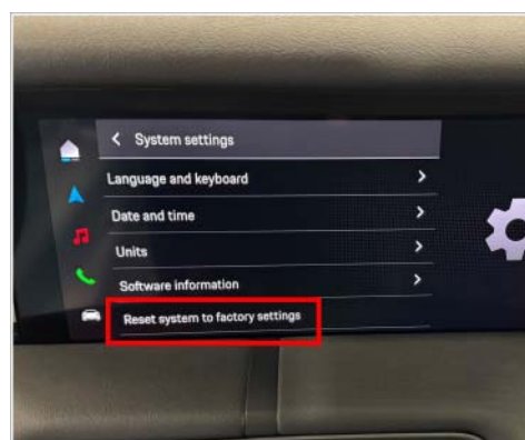
Reset system to factory defaults

3 Enter the campaign into the Warranty and Maintenance logbook.