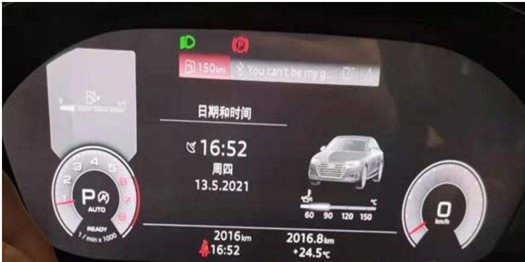
Figures 1-4. Example pictures of white sheen on the Audi virtual cockpit.