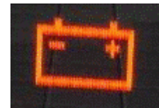
Figure 1. Red battery symbol.