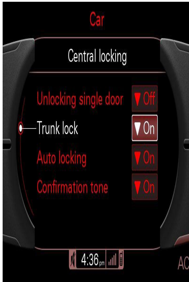
Figure 2. Trunk lock option in 3G MMI.