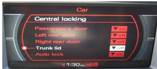
Figure 1. Trunk lid option in 2G MMI.