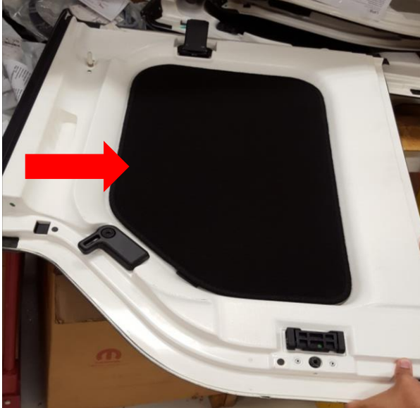
Fig 2 Mopar Headliner Kit.