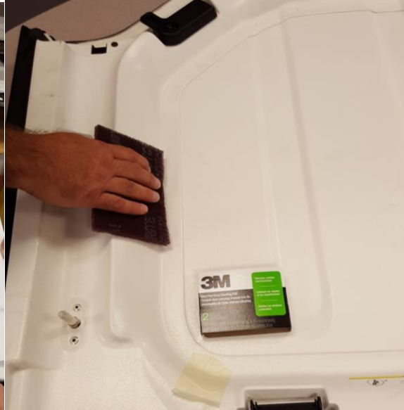
Fig 3 Scuffing Panel.

This document does not authorize warranty repairs. This communication documents a record of past experiences. STAR Online does not provide any conclusions about what is wrong with the vehicle. Rather, it captures all previous cases known that appear to be similar or related to the vehicle symptom / condition. You are the expert, and you are responsible for deciding on the appropriate course of action.