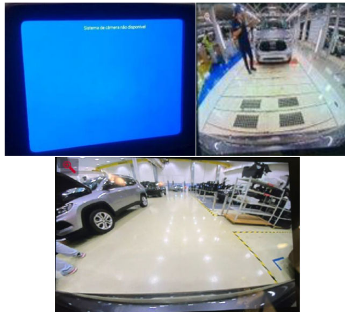
Fig. 1 Blue Screen, Blurry Screen, No Grid Line Screen

This Technical Service Bulletin (TSB) has also been released as a Rapid Service Update (RSU) 24-083, date of issue May 04, 2024. All applicable RSU VINs have been loaded. To verify this RSU service action is applicable to the vehicle, use VIP or perform a VIN search in DealerCONNECT/Service Library. All repairs are reimbursable within the provisions of warranty.