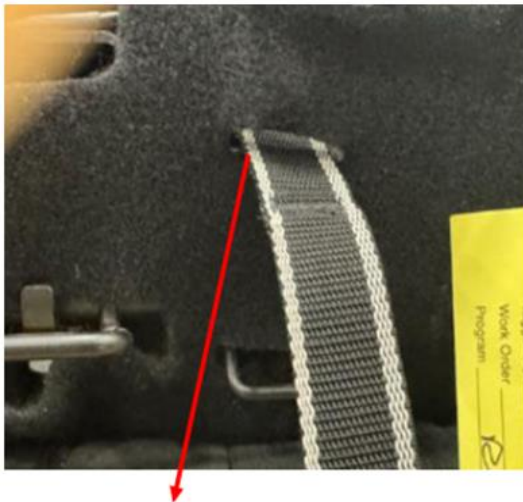
Current carpet slit