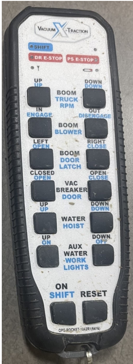
Figure 2 VXP Rocket Remote Decal