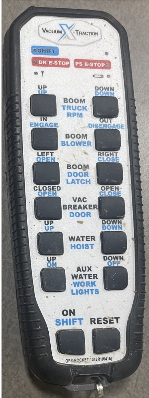
Figure 1 VXP Remote Decal