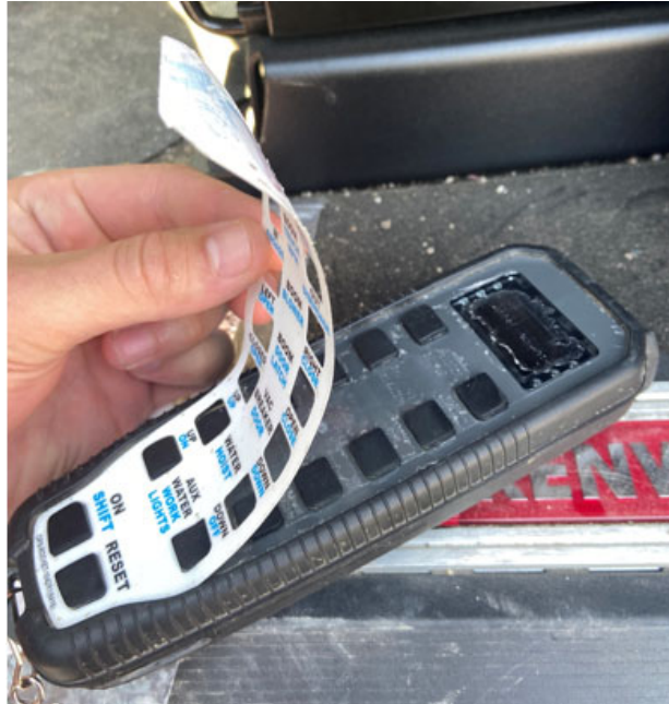
Figure 3 Rocket remote decal removal