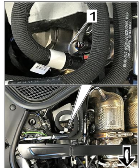
Contact point on high-pressure pump

If you can clearly hear the rattling noise at the contact point on the engine housing ⇒ Contact point on engine housing -2- , stop the engine and continue with Step 3.