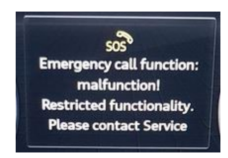
Figure 1. Emergency call malfunction warning.

An SOS Warning might be displayed in the instrument cluster (Figure 1).