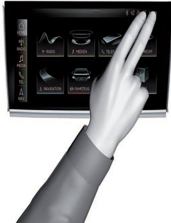
Figure 1. Gesture to enter the red engineering menu.