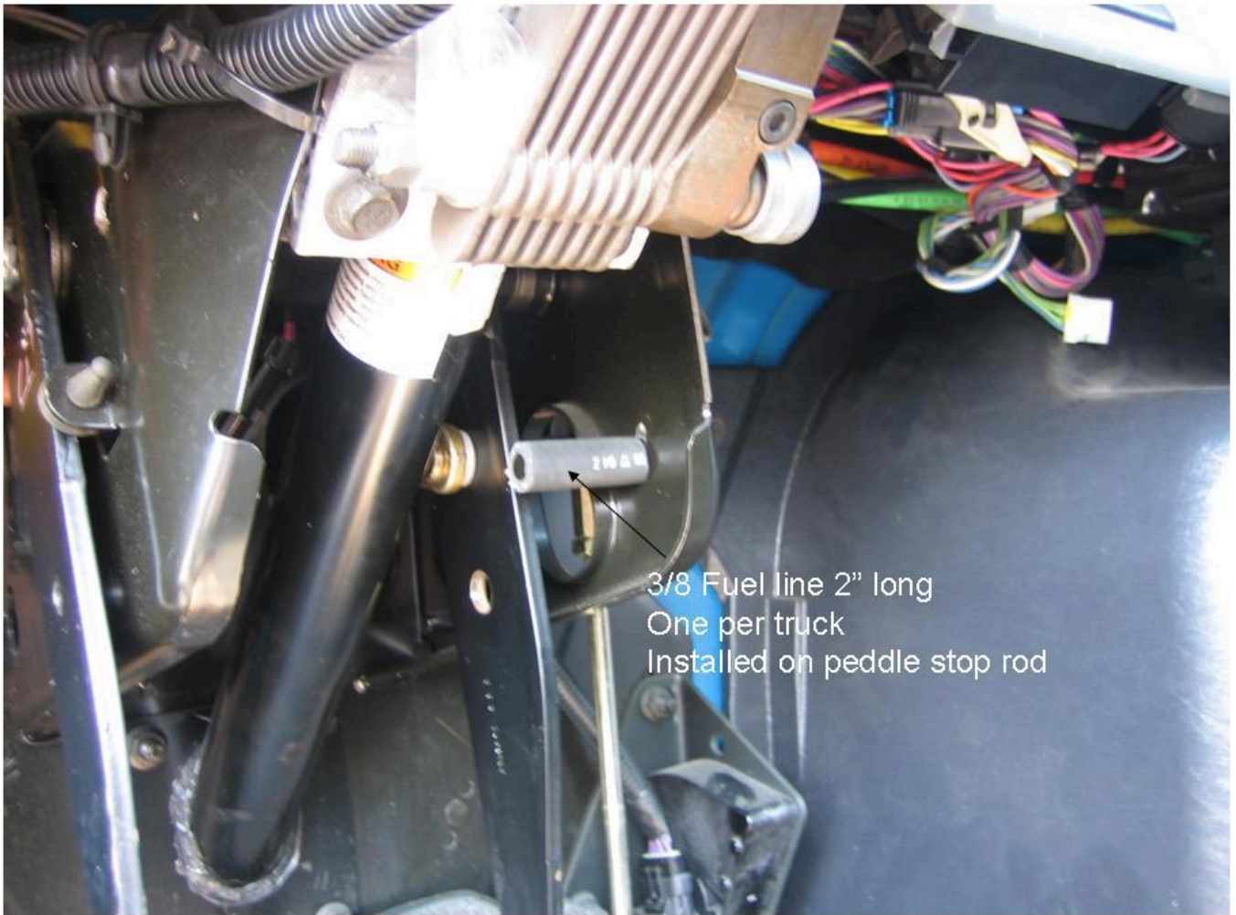
3/8 Fuel line 2" long One per truck Installed on peddle stop rod

If rubber line does not remove enough slack and the rattle noise is still a nuisance, adjust the clevis (8), lock nut (7), and push rod (6) to remove more slack. Do not over adjust, leave at least 3 threads on the push rod.