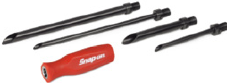
Figure 2 - Snap-On - WINS1000R

Recommended using VAS 6720 & Wire Insertion Tool Set (e.g. Snap-On - WINS1000R).