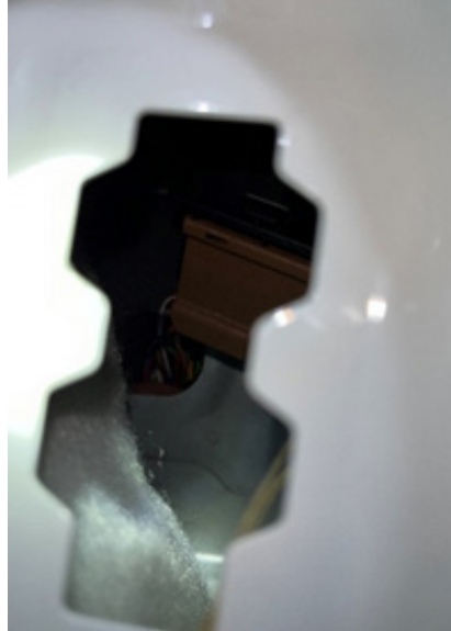
Figure 8 - Door Jam Internal Cavity