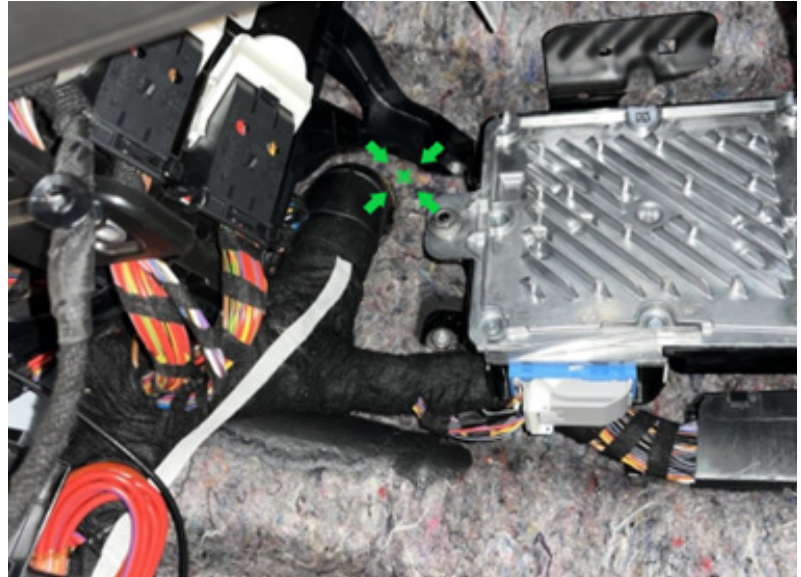
Figure 13 - Firewall Exit Point for Overlay (Between BMC1 & OTA-FC Below Bracket)