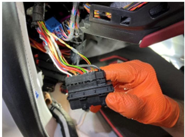
Figure 6 - Door Harness Connector