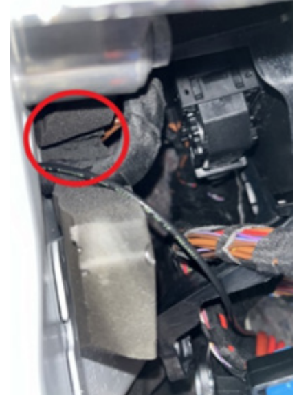
Figure 9 - Entry Point into Cavity (Foam Piece Circled)