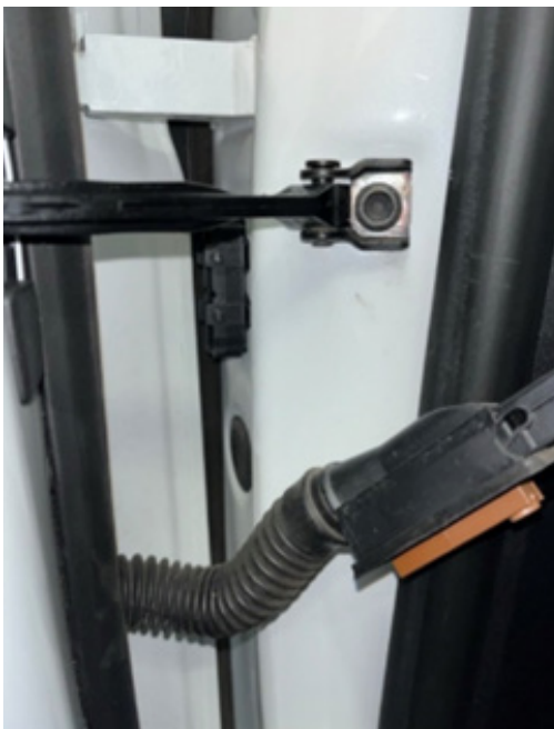
Figure 5 - Door Harness Connection Point