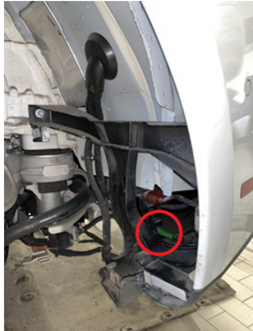
Figure 4 - Rear Camera Connection Point (Rear Driver Wheel Well)