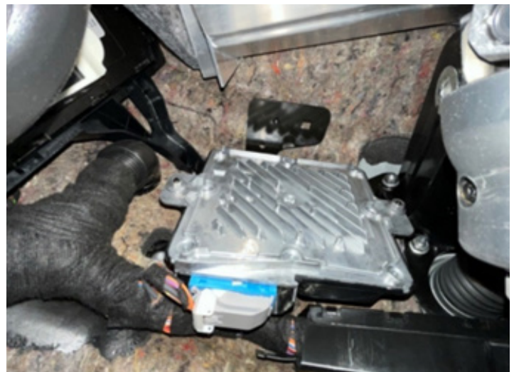
Figure 11 - Over-The-Air Function Controller