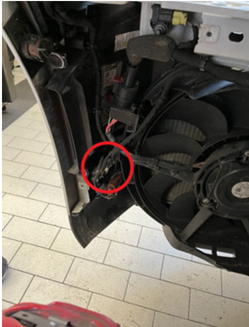
Figure 3 - Front Camera Connection Point (Front Driver Wheel Well)