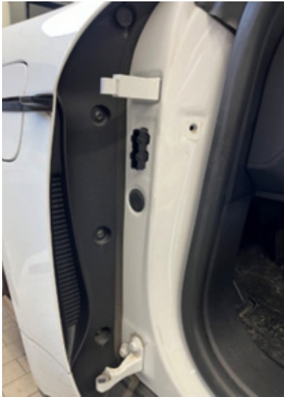
Figure 7 - Body Side Door Harness Connector