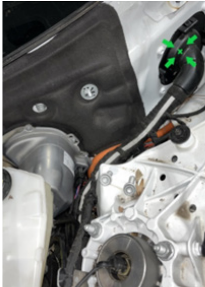
Figure 12 - Firewall Entry Point for Overlay (Under Wiper Motor)