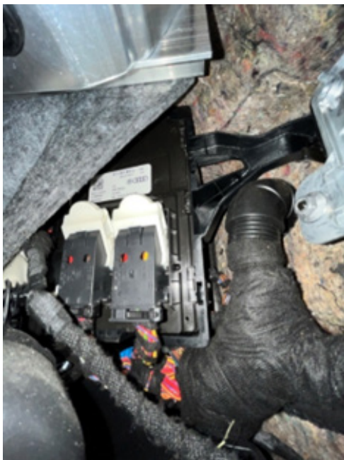
Figure 10 - Front-End Body Control Unit