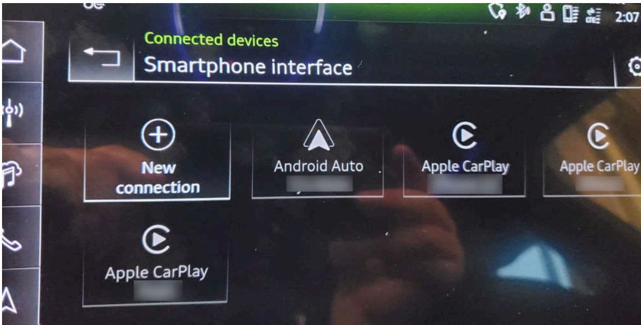
Figure 1: wASI connections grayed out.