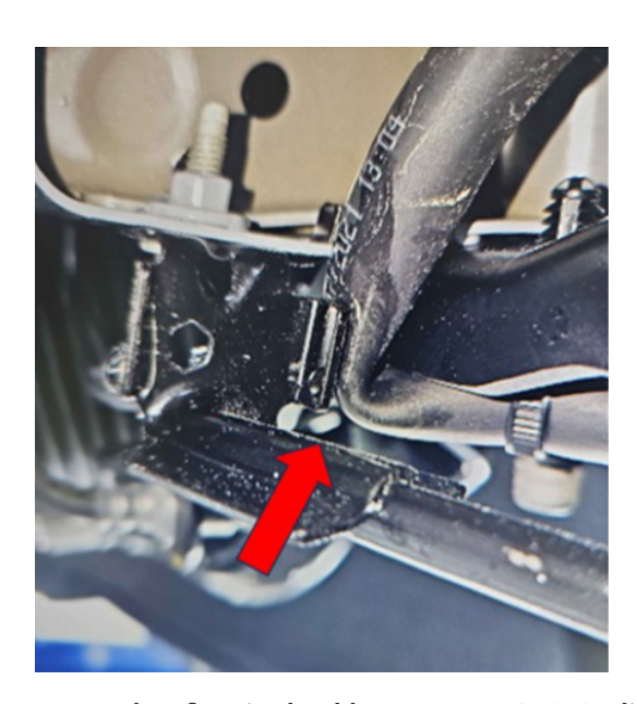
Example of a pinched hose on a 2023 Cadillac Escalade below: