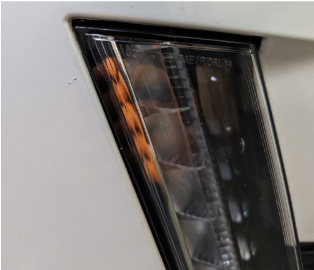
Aftermarket RH Park/Turn Signal Lamp Assembly.