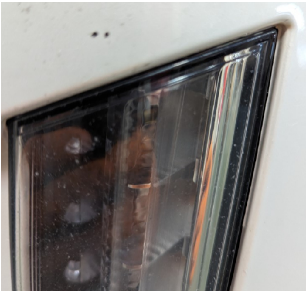
O.E.M LH Park/Turn Signal Lamp Assembly.