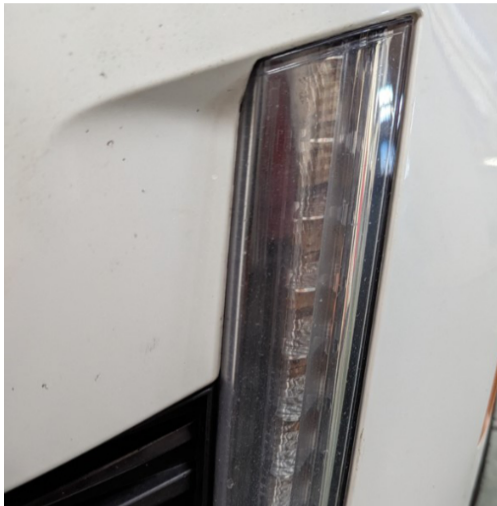
O.E.M LH Park/Turn Signal Lamp Assembly.

This condition could be caused by aftermarket lamp assemblies back feeding voltage to the BCM, keeping the BCM awake. See examples below.