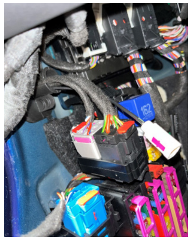
Figure 11 Door Harness Connection Point (2)