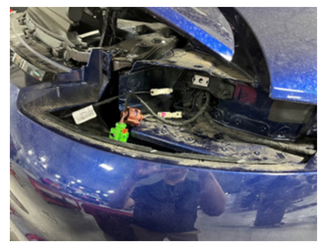
Figure 8 Rear Camera Connection Point (Right Rear Taillight)