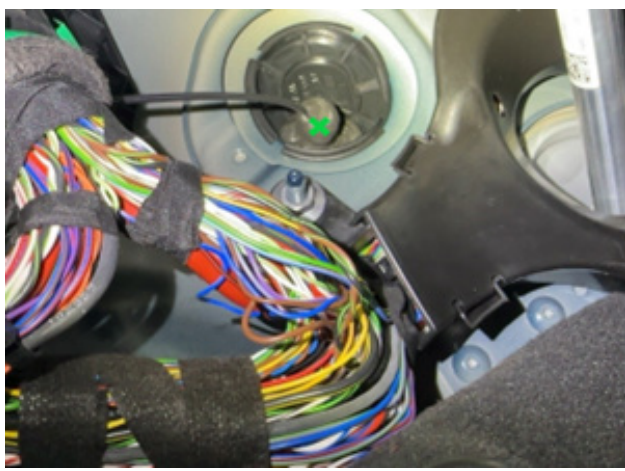
Figure 4 Cabin Side - Clutch Master Cylinder Grommet