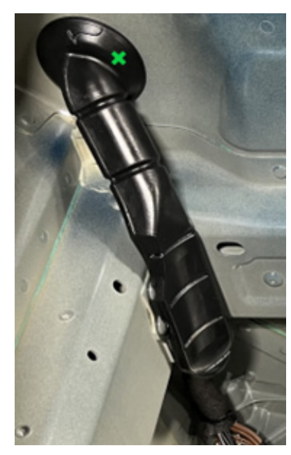
Figure 7 Tub Side - Passenger Side Grommet