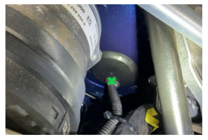
Figure 5 Exterior Side - Clutch Master Cylinder Grommet

Pictures above are of driver side camera overlay to zFAS control unit from A-pillar connector. Grommet of use is for the missing clutch master cylinder. If the vehicle is a manual, refer to the pictures below to be used for driver side camera overlay. Passenger footwell grommet is to also be used for rear and passenger camera overlays. When overlaying wires, ensure wires are secured to existing harnesses and area of piercing is properly sealed. Recommended points of piercing are designated by green X's.