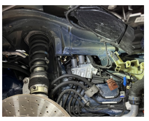
Figure 9 Front Camera Connection Point (Front Right Wheel Well)