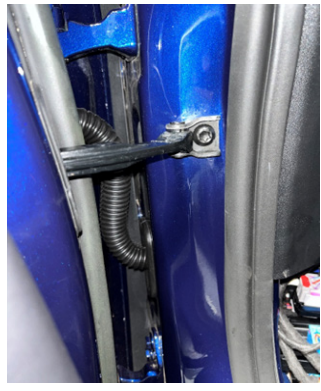
Figure 10 Door Harness Connection Point (1)