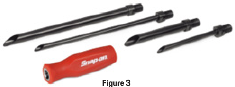
Snap-On - WINS1000R

Recommended using VAS 6720 & Wire Insertion Tool Set (e.g. Snap-On - WINS1000R).