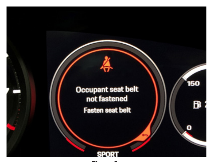
Figure 1: Red warning in the instrument cluster

The customer complains of a red warning message in the instrument cluster that reads, "Occupant seat belt not fastened. Fasten seat belt." This message appears despite all seat belts being fastened.