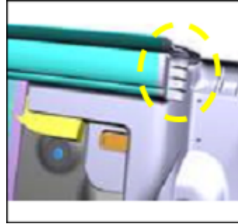
After the modification: to add ribs at the rear sash molding

Customers having this concern should have their vehicle repaired using the following repair procedure.