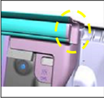
Before the modification