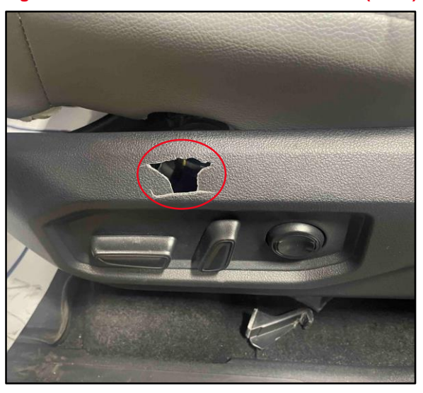
Figure 2. Loose/Broken Side-cushion Shield (8 WP)