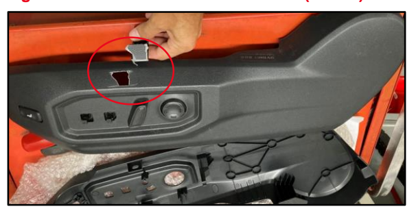
Figure 4. Broken Side-shield Cushion (10 WP)