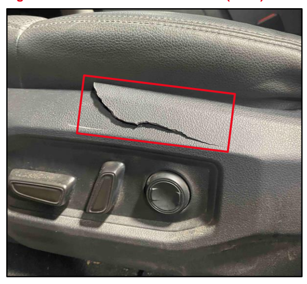
Figure 3. Broken Side-cushion Shield (8 WP)