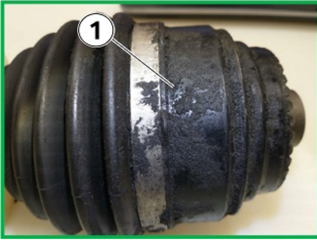
Example of dirt/contamination from outside influence (1).