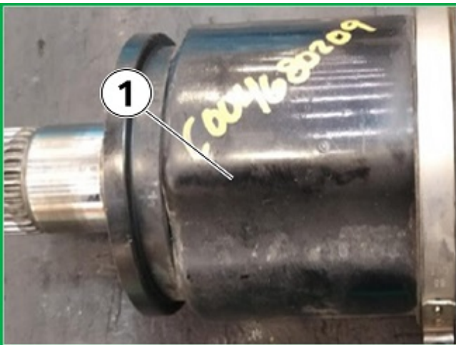
Example of dirt/contamination from outside influence (1).