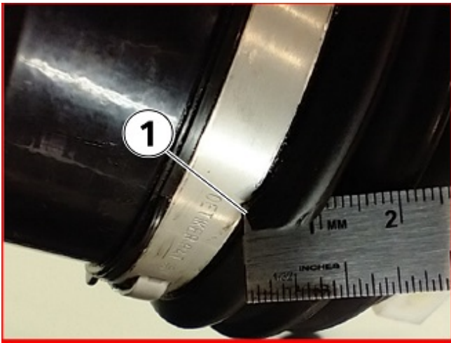
Tear or cut in the boot (1).