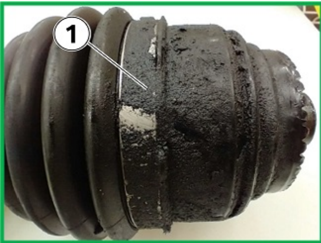
Example of dirt/contamination from outside influence (1).