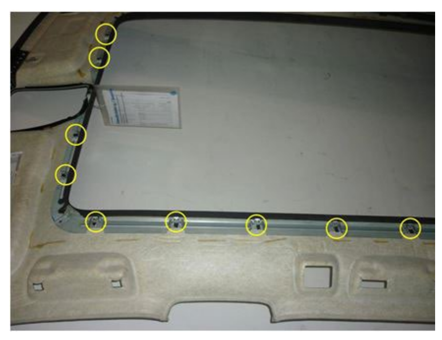
Figure 1. Location of the headliner to sunroof frame clips.

2. Remove the headliner. The clips shown in the illustration will need webbing adhesive tape (D 004350A2) (Figure 1).