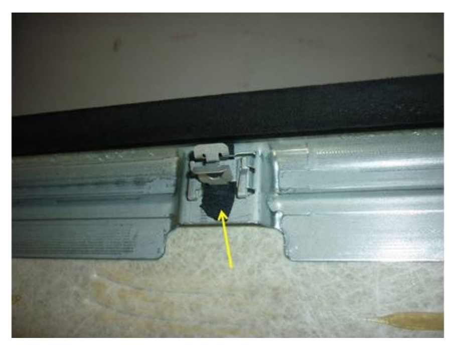
Figure 3. Clips reinstalled.

5. Apply webbing adhesive tape to the sunroof frame lip at each clipping point (Figure 4).