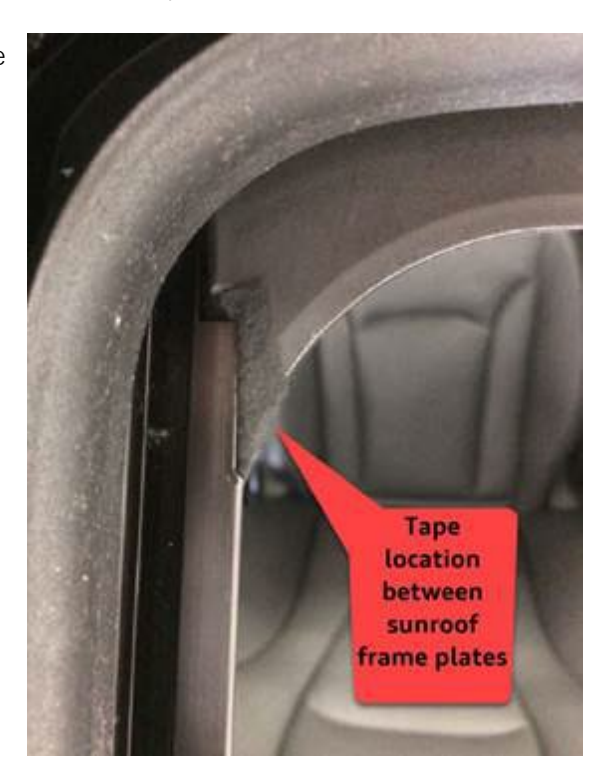
Figure 6. Webbing adhesive tape applied between the side and front sunroof frame plates.

7. Apply webbing adhesive tape between the sections of the sunroof frame plates on both the right and left sides as shown in the illustration (Figure 6).