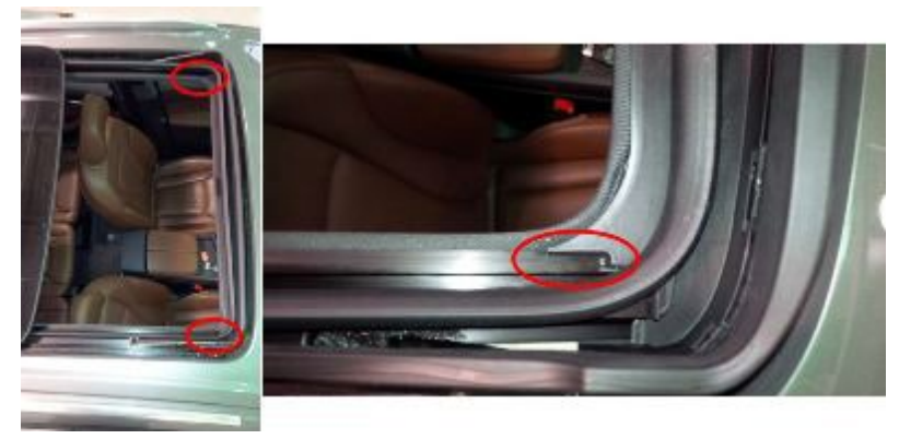
Figure 5. Areas of the sunroof frame to be isolated with webbing adhesive tape.

6. There are two additional points of contact at the front sunroof frame plates that could be a source for noise (Figure 5).