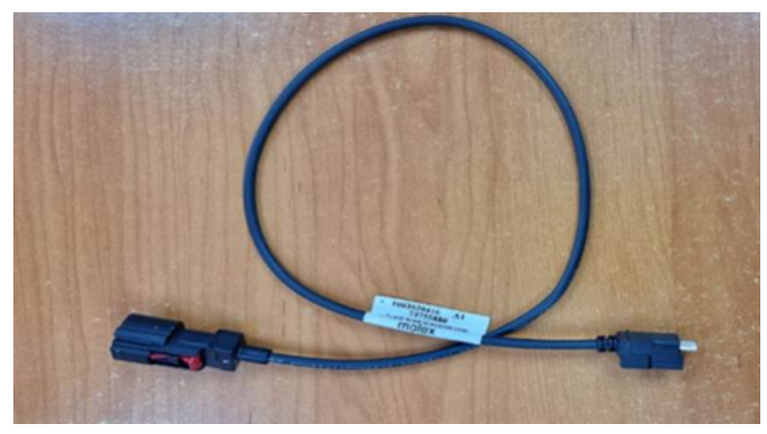
Fig. 1 USB Cable For Center Console Harness