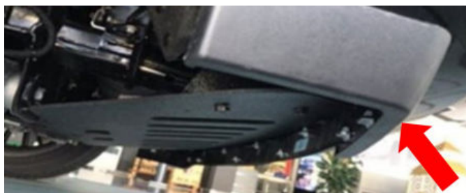
Fig. 1 Incorrect Air Dam Installed

This Technical Service Bulletin (TSB) has also been released as a **Rapid Service Update (RSU) 24-006 , date of issue January 05, 2024. ** All applicable RSU VINs have been loaded. To verify this RSU service action is applicable to the vehicle, use VIP or perform a VIN search in DealerCONNECT/ Service Library. All repairs are reimbursable within the provisions of warranty. This RSU will expire 18 months after the date of issue.