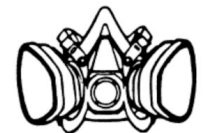
Example of a NIOSH-approved respirator