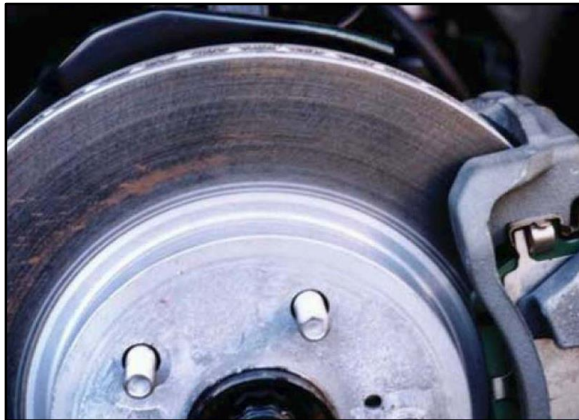
Figure 2. Slight Rust on Rotor (Easy to Remove by Braking)