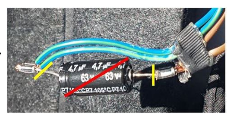
Figure 2: Suppression capacitor C24.

Insulate the exposed crimps using heat-shrink hose from VAS 1978B wire harness repair set and then wrap the wiring harness in fabric adhesive tape N 10592002