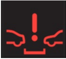
Figure 2. Distance warning light.