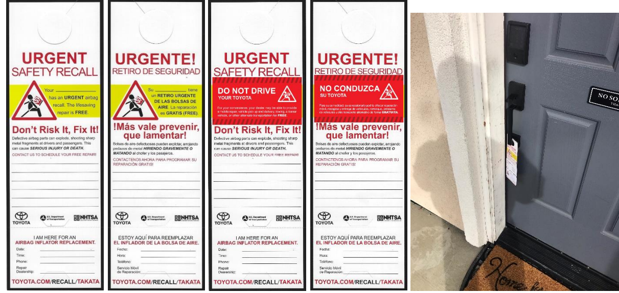
English/Spanish Door Hanger Do Not Drive English/Spanish

Takata Canvassing Locations: CA, FL, TX (generally in major metropolitan areas within these states) and PR.