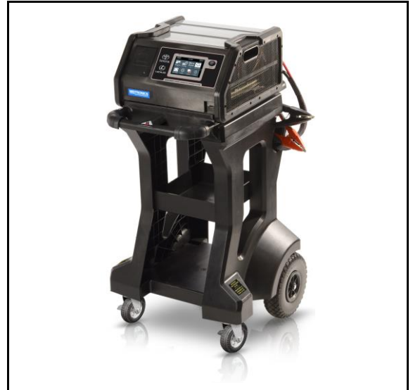
Figure 1. DCA-8000 Battery Diagnostic Tool