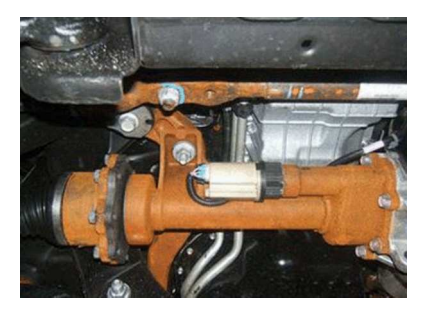
Front axle housing