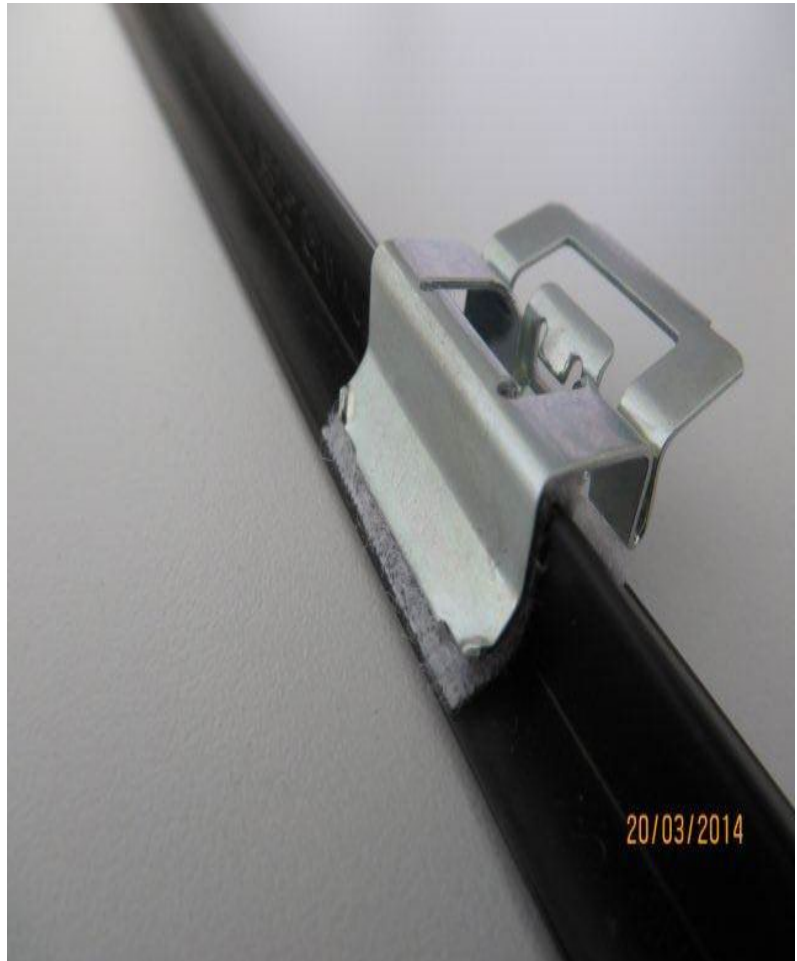
Figure 4. Retaining clip isolated with the fleece adhesive tape.