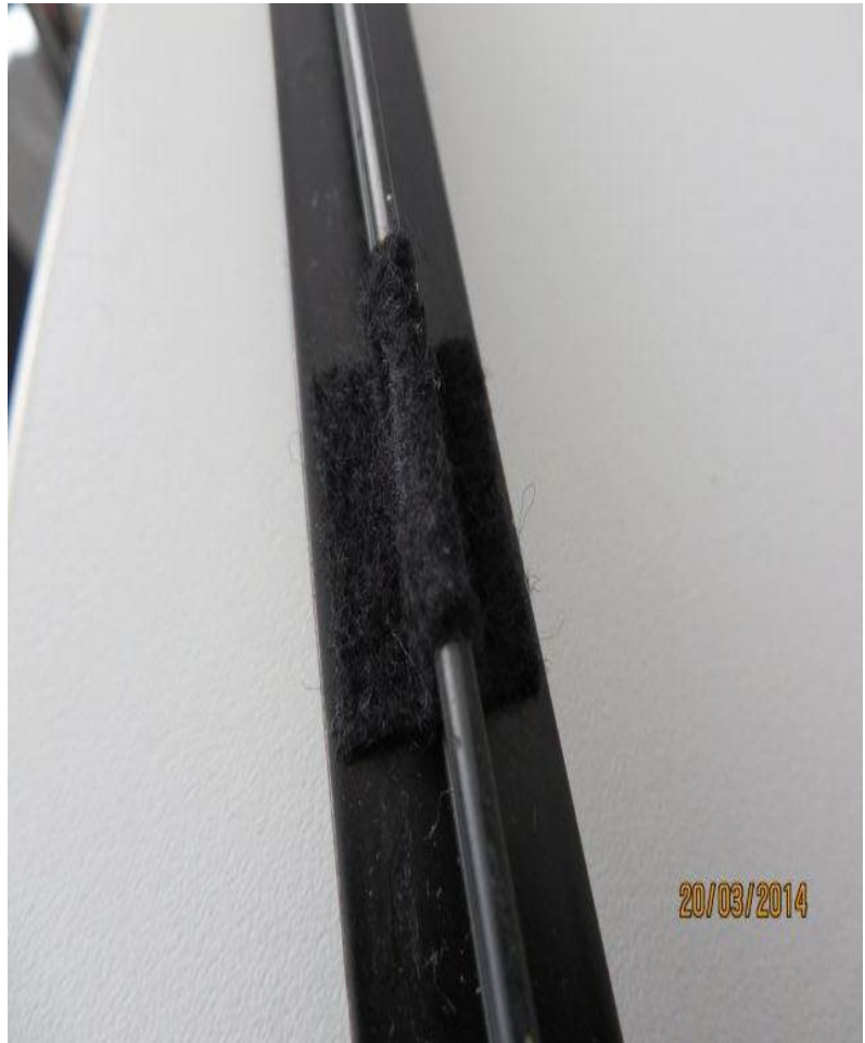
Figure 3. Fleece adhesive tape section applied.