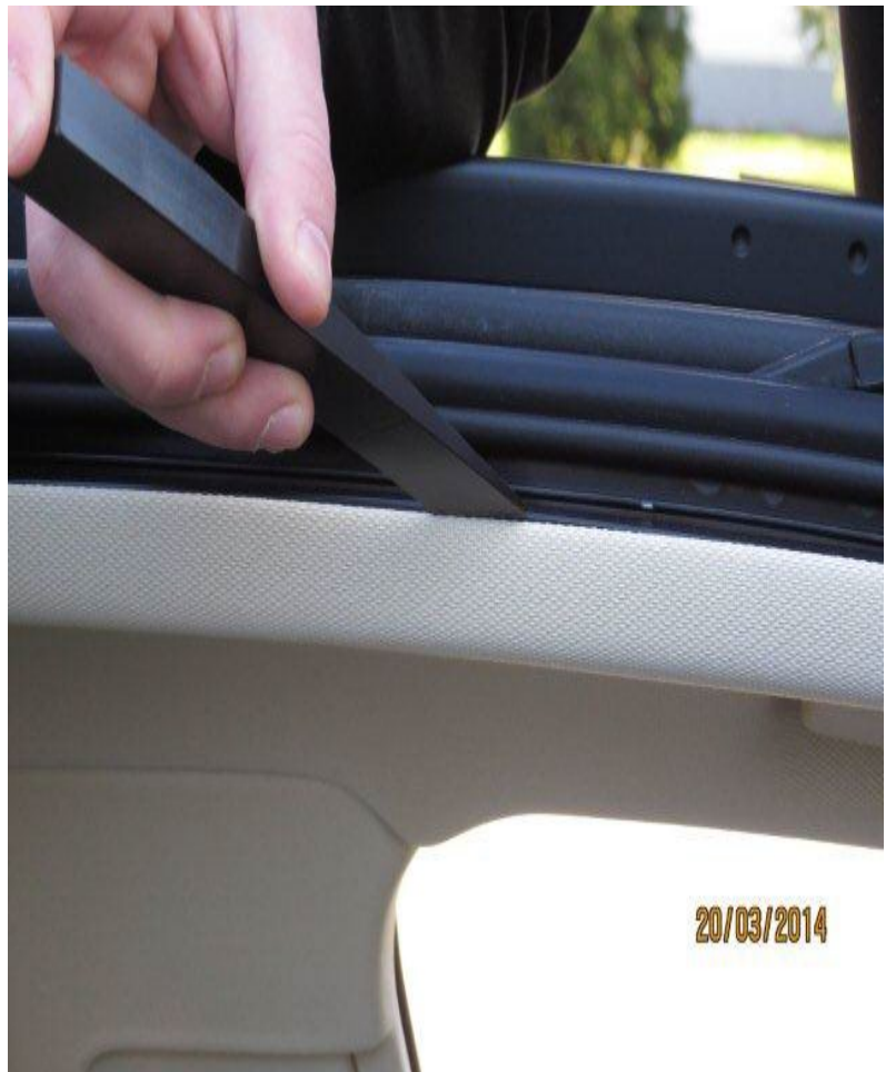
Figure 1. Unclipping the sunroof cover trim frame.