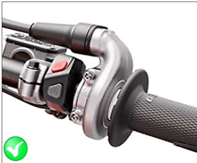
Fig. 1 – New Start/Stop Switch #A46011074000