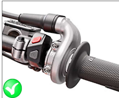
Fig. 1 – New Start/Stop Switch #A46011074000