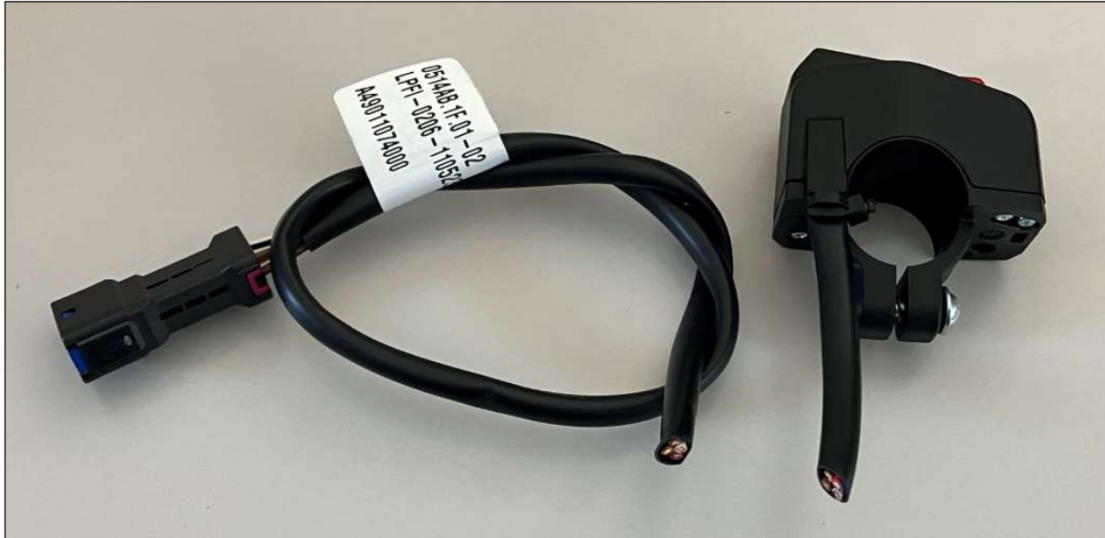
Fig. 3 – Destroy the original start/stop switch, take a photo of it and attach the photo to the claim before submitting.

Replaced start/stop switches #A49011074000 must be stored for at least 6 months and must NOT be disposed of before the 6 month storage time period. A photo of the replaced and destroyed switch (see Fig. 3) must be attached to each TI warranty claim.