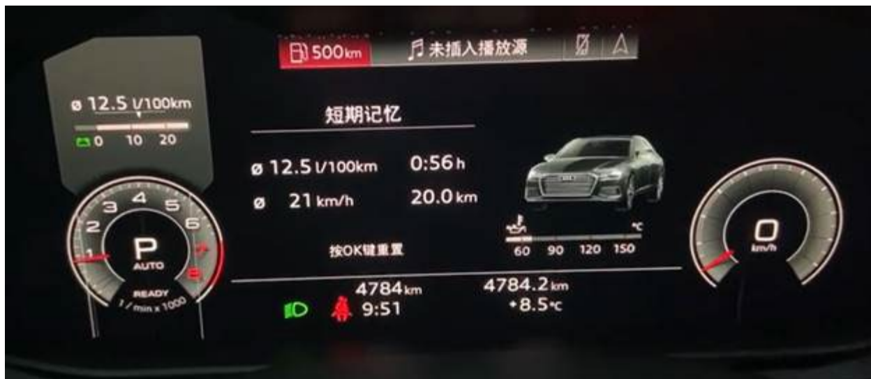
Figure 2: This is an example of vertical lines in the virtual cockpit.