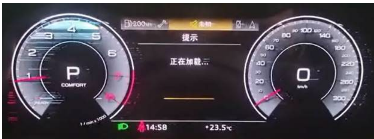
Figure 1: This is an example of horizontal lines in the virtual cockpit.

Customer states: The Audi virtual cockpit displays flickering horizontal, vertical or diagonal lines (Figures 1-2).