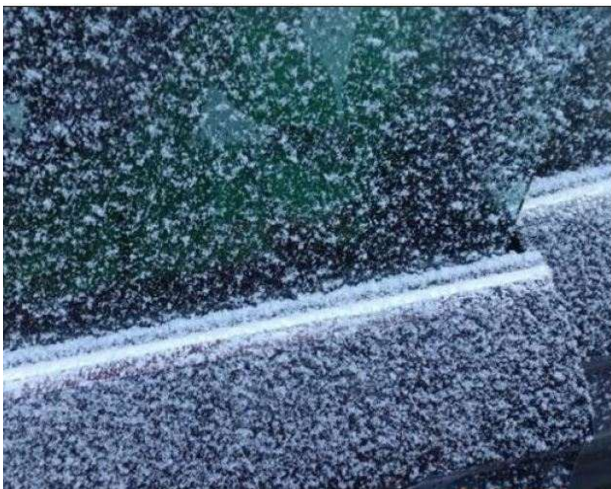
Figure 1. Snow and ice build-up on window and window slot seal surfaces.

Due to snow and ice adhesion the window and window slot seal can be bonded, resulting in a blockage that can render the window auto-drop function inoperative (Figure 2).