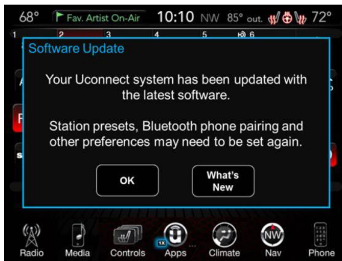
Fig. 4 Software Confirmation