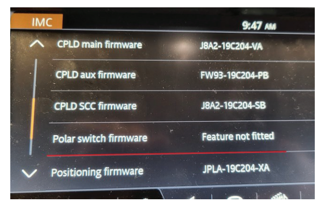
If Polar Switch Firmware does not report and shows "Feature not fitted" recommendation is IMC replacement