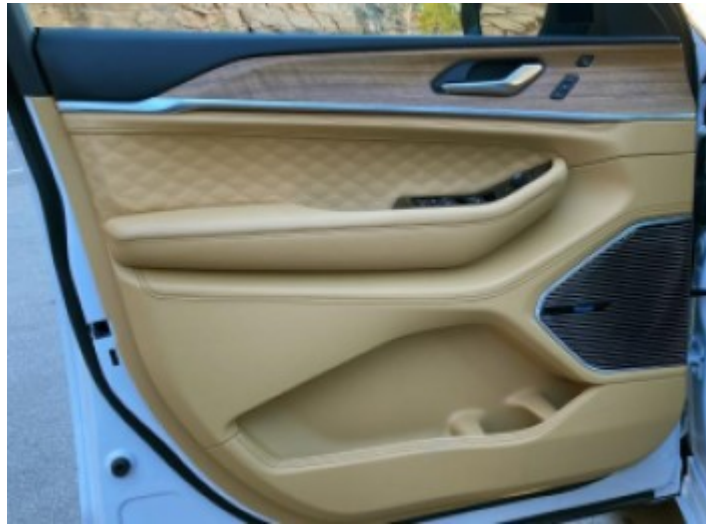
Fig. 1 Front Door Trim Panel