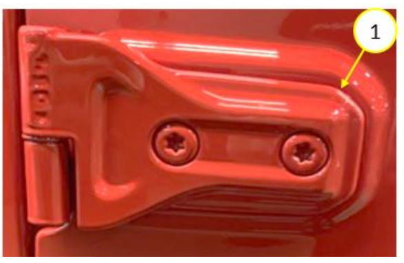
Fig. 3 New Style Hinge With Zinc Shim