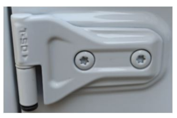
Fig. 2 Old Style Hinge