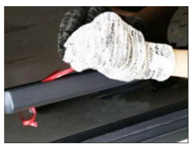
Fig. 6 Removing Tape

NOTE: To ensure proper adhesion, apply consistent and uniform pressure of approximately 40 PSI over the entire surface of each molding. Remove the protective covering from the molding if applicable (Fig. 6).