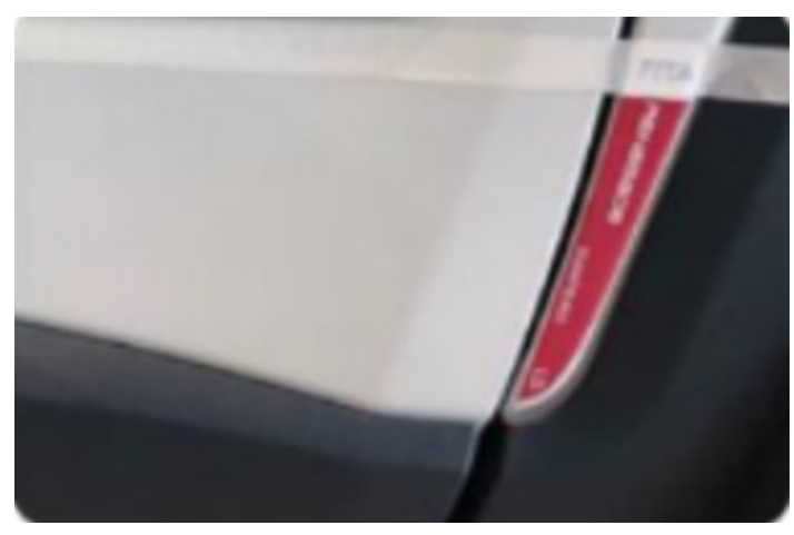
Fig. 3 Installing Front Template

3. Install the front (left and right) template on the lower door. Follow the gap between the door and wheel box (Fig. 3) .