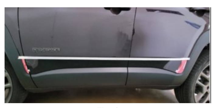
Fig. 4 Templates In Place

4. Use tape to connect the two templates as shown in the image below (Fig. 4) .