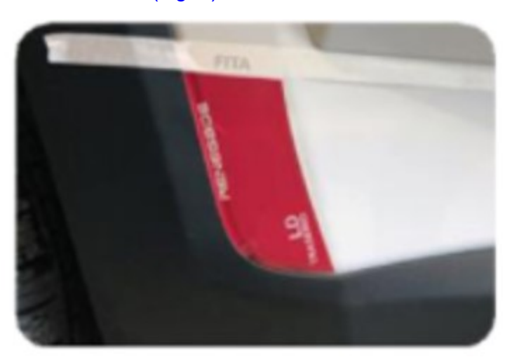
Fig. 2 Installing Rear Template

2. Install the rear (left and right side) template for assembly on the doors, starting in the base of the door and following the line of the doors' trim (Fig. 2).