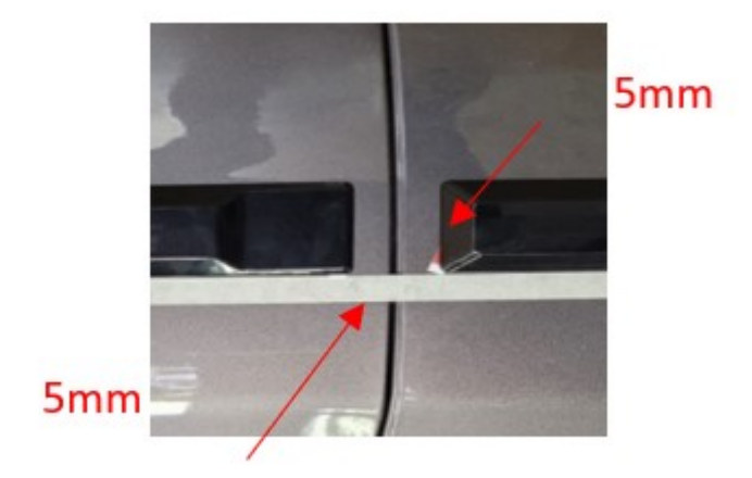
Fig. 5 5 mm Gap

5. The door moldings must be placed above the tape. Install the door molding at about 5 mm (3/16 in) from the doors' edge (Fig. 5).