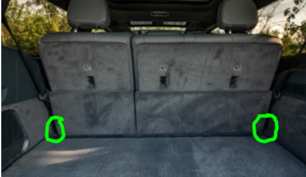
Fig. 2 Area To Inspect