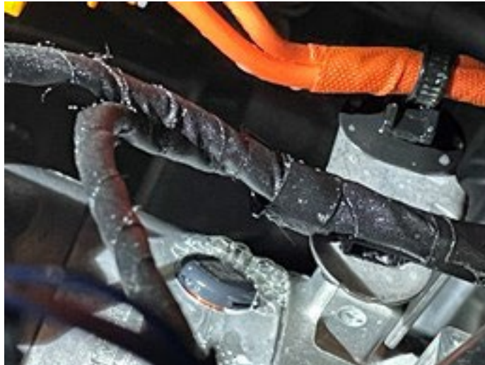
Figure 2. Active compressor pressure relief valve leak.