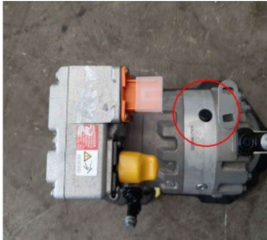
Figure 1. Pressure relief valve on the air conditioning compressor.