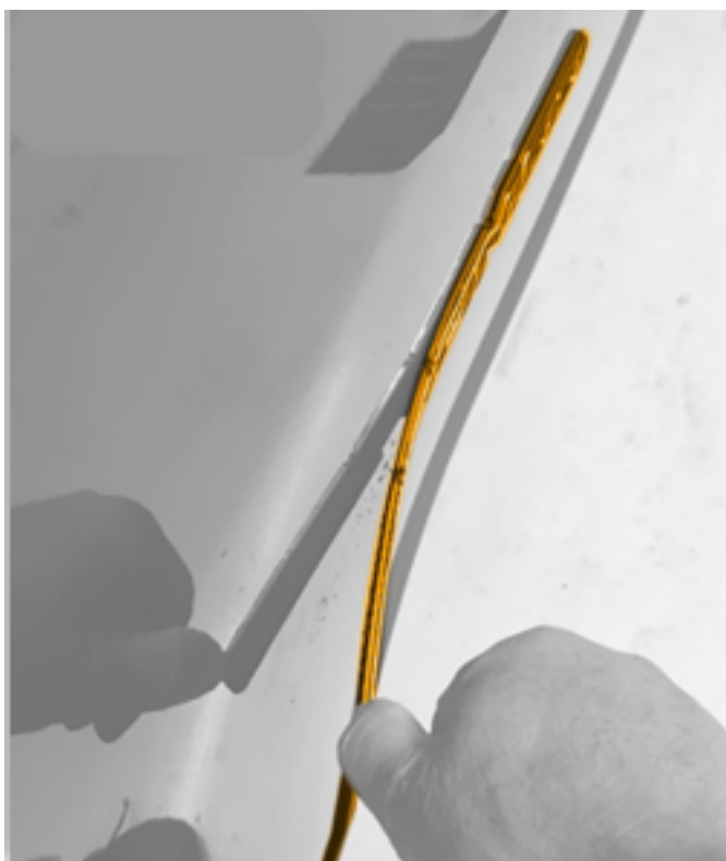
Fig. 2 Nameplate Badge Adherence Check

NOTE: If the nameplate badge partially or completely detaches, the badge is NON compliant Fig. 2 .