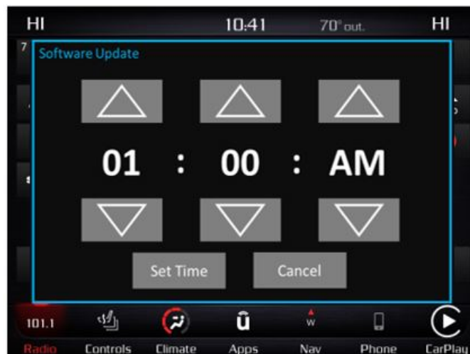
Fig. 2 Schedule Update

NOTE: If selecting “Schedule Update” the screen below will be displayed. The customer can select the exact time they want the update to begin Fig. 2 .