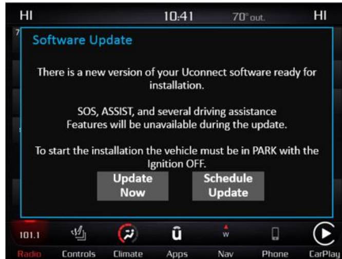
Fig. 1 Software Update

Customers will see a notification on their radio screen when new software is available for their radio Fig. 1 . The owner will have the option to update the radio or schedule the update for later. There is not an option to decline the update indefinitely, the update must be performed.