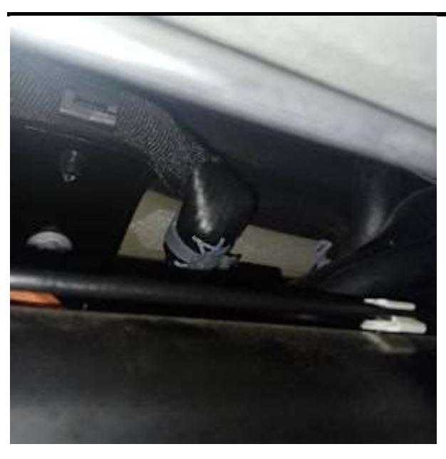
Figure 2. Hose twisted at rear power electronics.