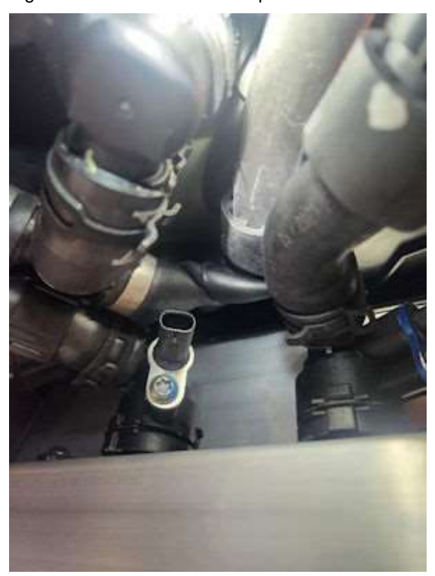
Figure 3. Hose twisted at front of high-voltage battery.