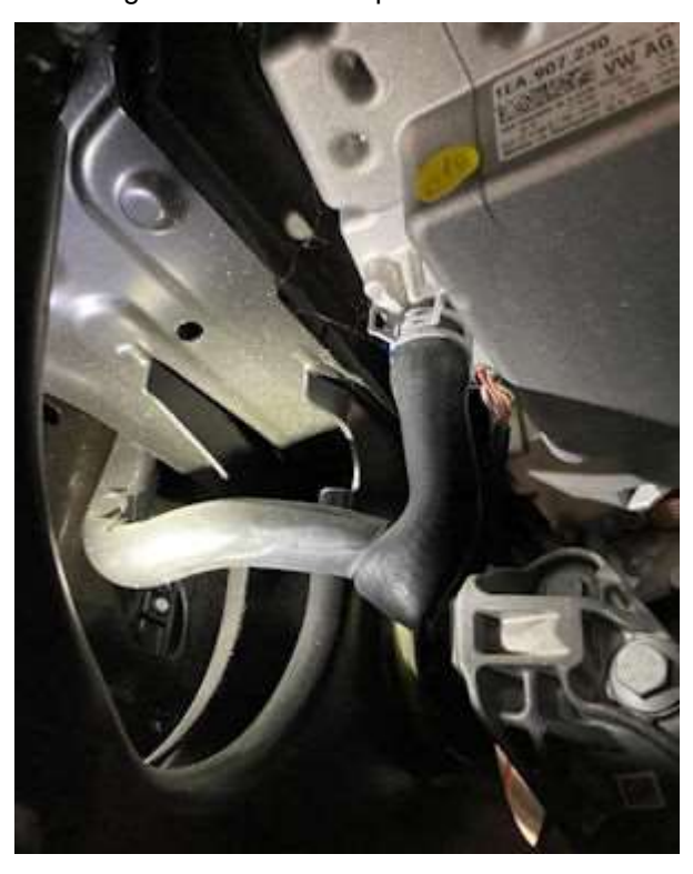
Figure 1. Hose twisted at rear power electronics.

Following are several examples of different conditions and locations to inspect.