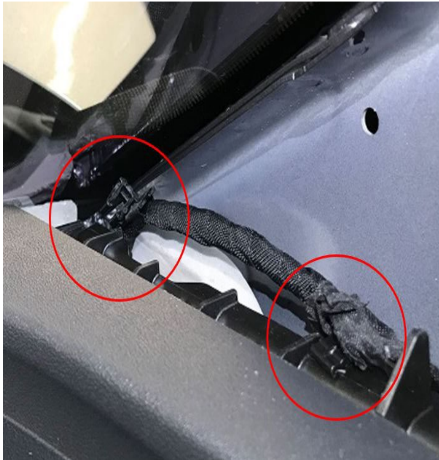
Figure 2: Unclip the harness.