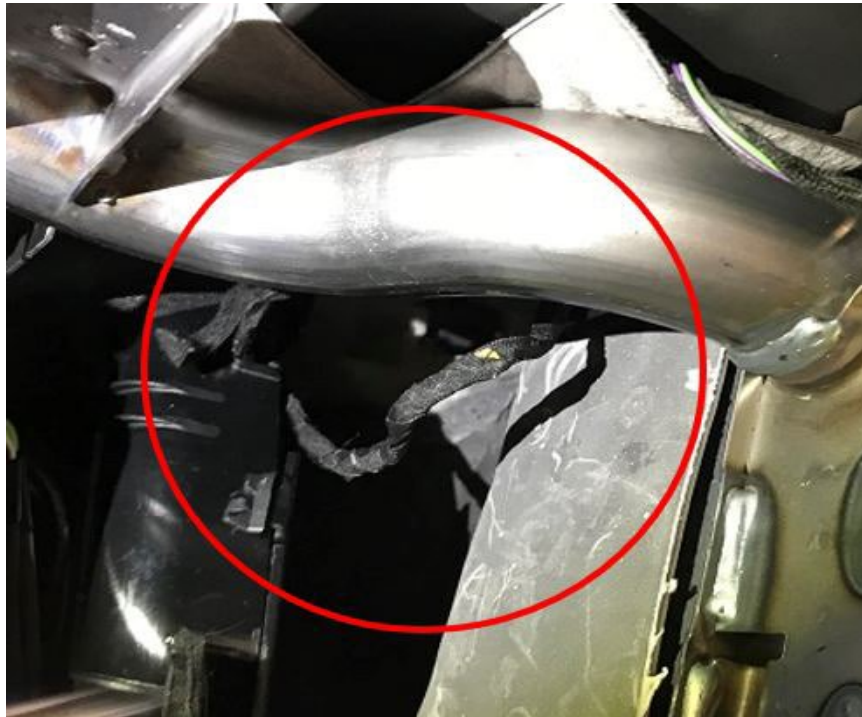
Figure 3: Secure the wires.

Secure the wires as needed to ensure they no longer contact other components (Figure 3).