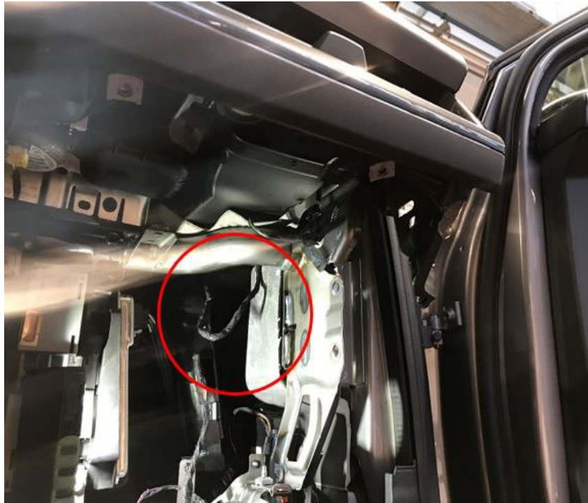
Figure 1: Location of harness inspection.