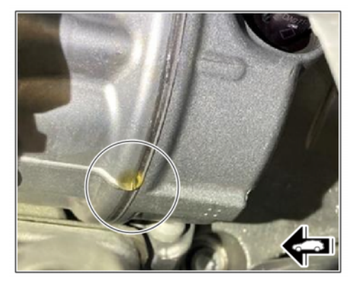
Drop formation on air-conditioning compressor

compressor housing. ⇒ Drop formation on air-conditioning compressor