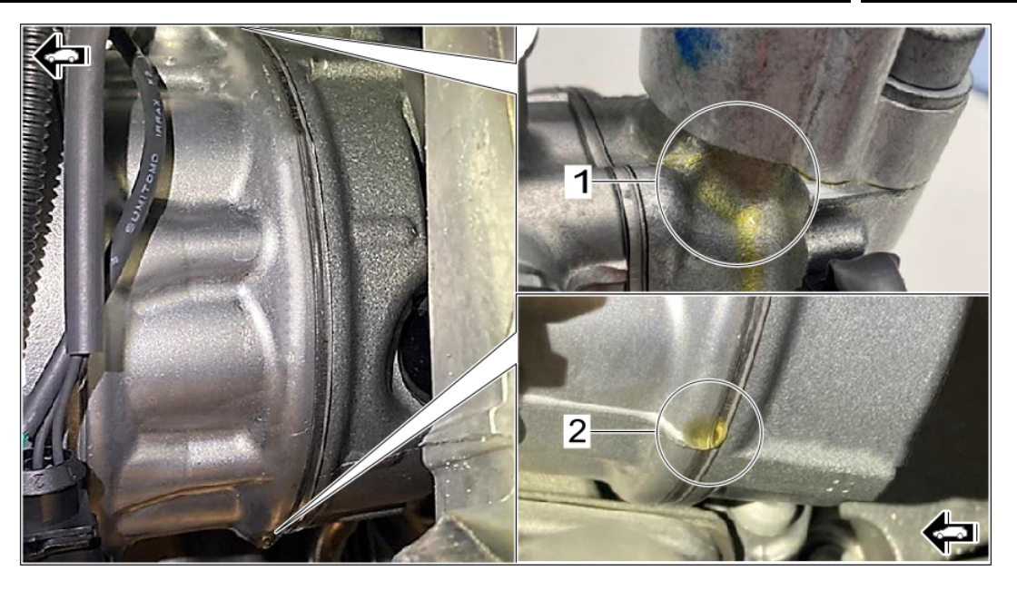
Oil loss on air-conditioning compressor