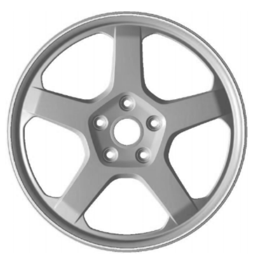
20-inch 982 25 years