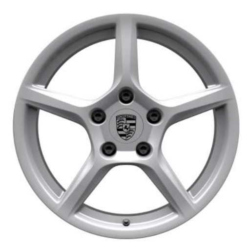
18-inch Boxster 4