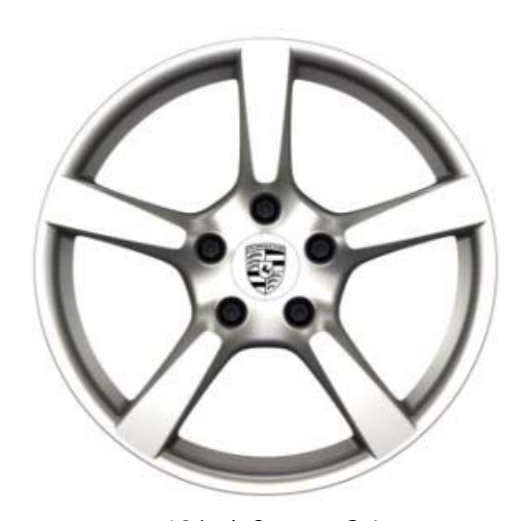
19-inch Cayman S 4