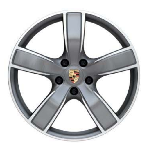
20-inch Carrera Sport