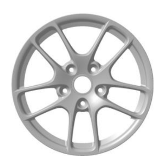
18-inch Cayman 3