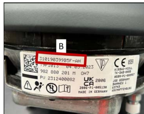
Airbag module number (sample illustration)