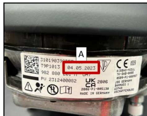
Production date (exemplary representation)